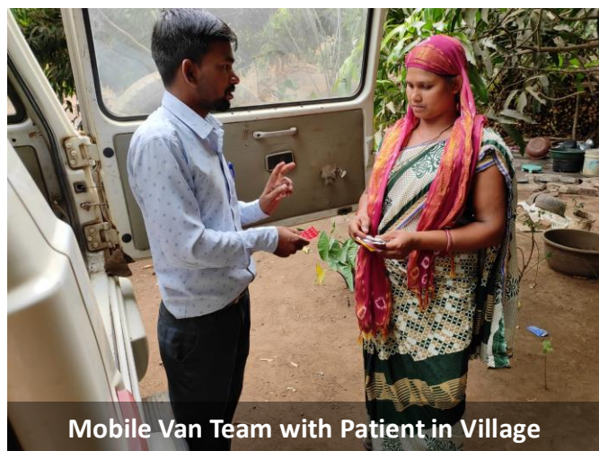
Mobile Van Team with Patient in Village