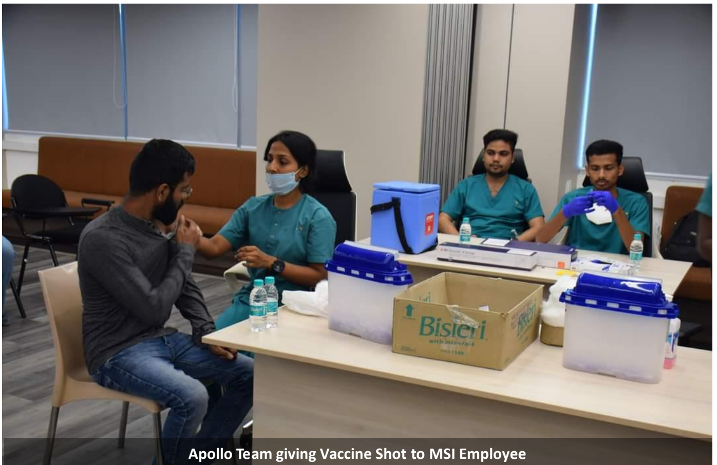
Apollo Team giving Vaccine Shot to MSI Employee