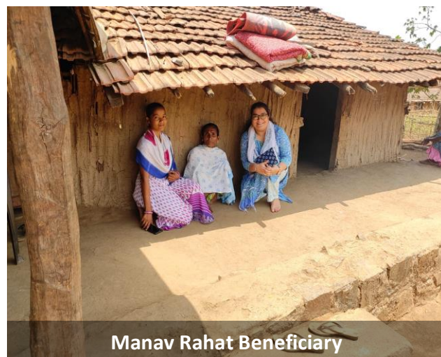
Manav Rahat Beneficiary