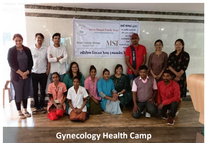
Gynecology Health Camp