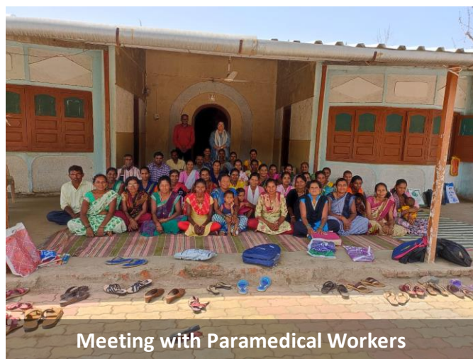
Meeting with Paramedical Workers