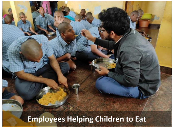
Employees Helping Children to Eat