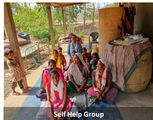
Self Help Group