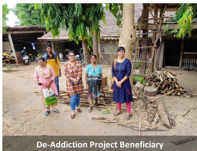
De-Addiction Project Beneficiary