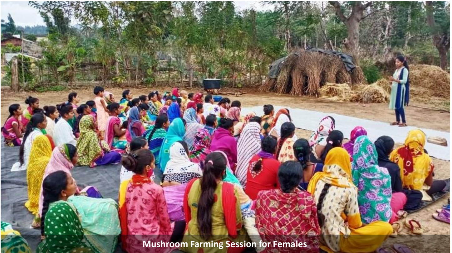
Mushroom Farming Session for Females