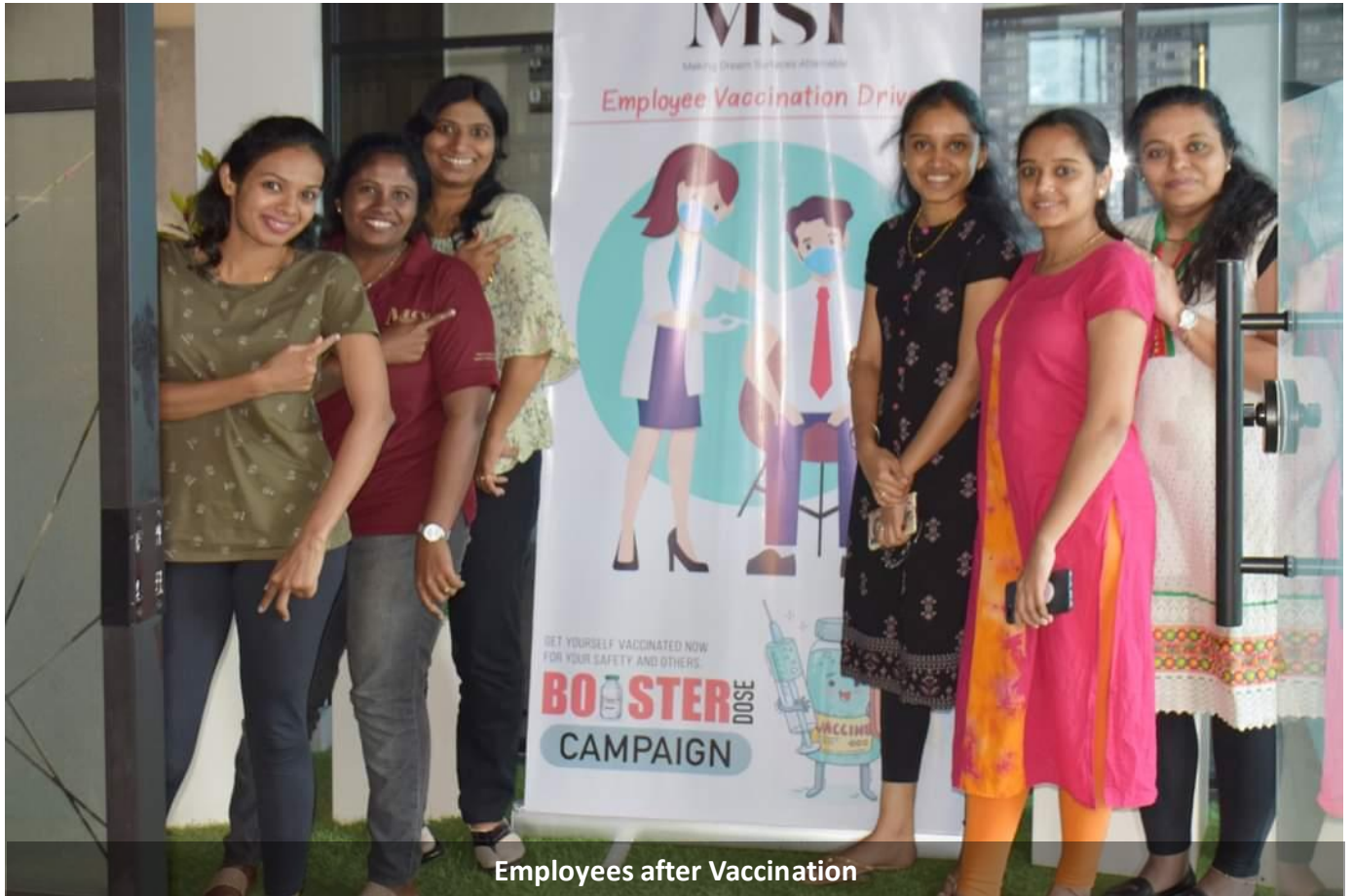
Employees after Vaccination