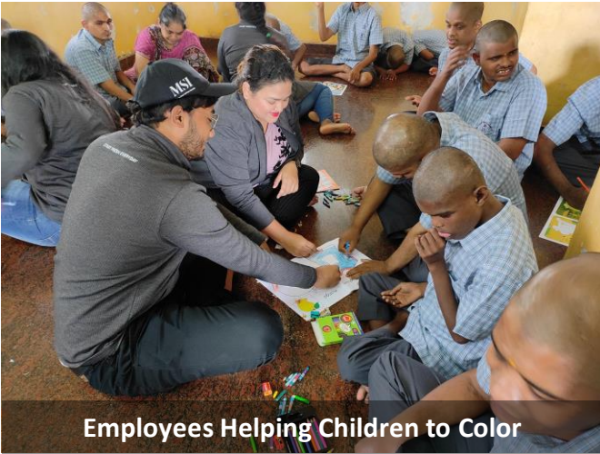
Employees Helping Children to Color