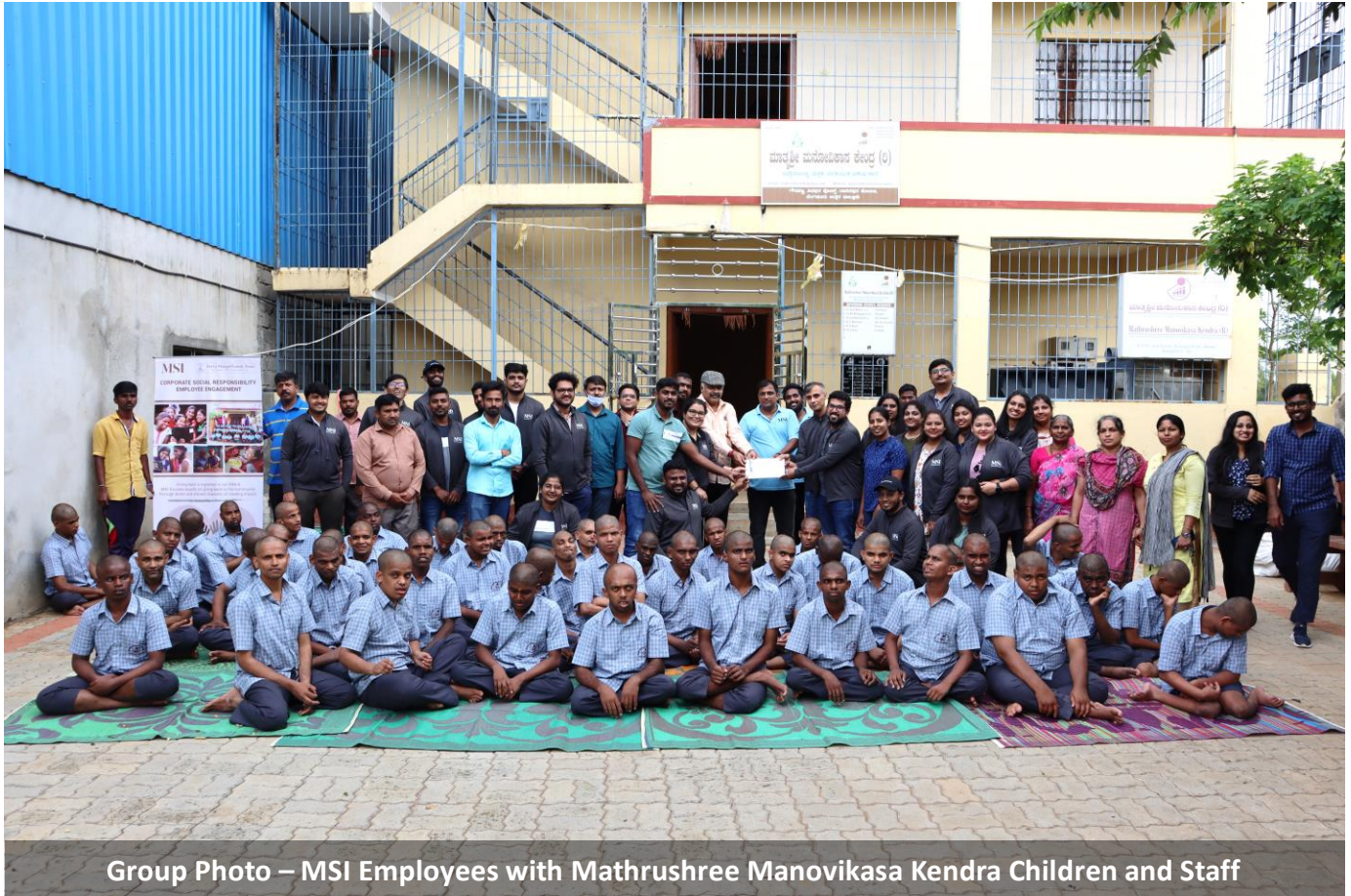
Group Photo – MSI Employees with Mathrushree Manovikasa Kendra Children and Staff