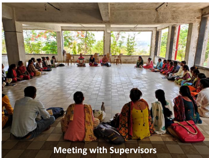
Meeting with Supervisors