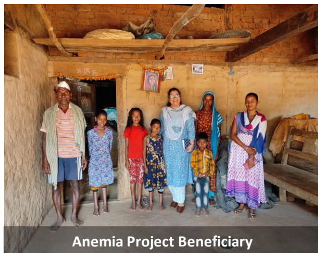
Anemia Project Beneficiary

Paramedical Workers regularly help and motivate people to leave opium and not to restart its consumption once left. Beneficiaries who completely leave opium then help and motivate other people with their story. Overall, it was a wonderful experience to meet the entire Bhansali Trust team and beneficiaries in Dang.