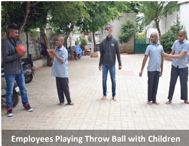
Employees Playing Throw Ball with Children