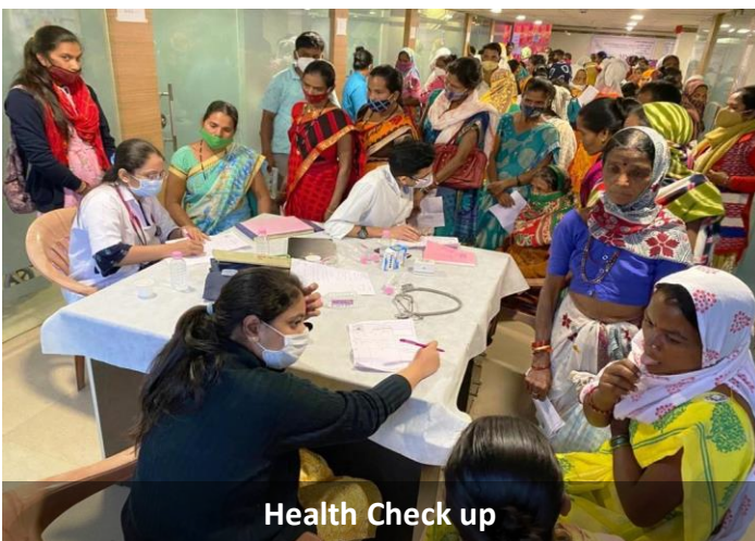
Health Check up

Check-up for each senior citizen is done free of cost. Patients who suffer from diabetes, high BP and other problems are identified and put on treatment, this helps to prevent or delay complications like kidney failure, heart problem, brain stroke etc. 3,801 seniors have been included in this program.