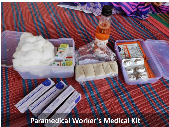
Paramedical Worker's Medical Kit