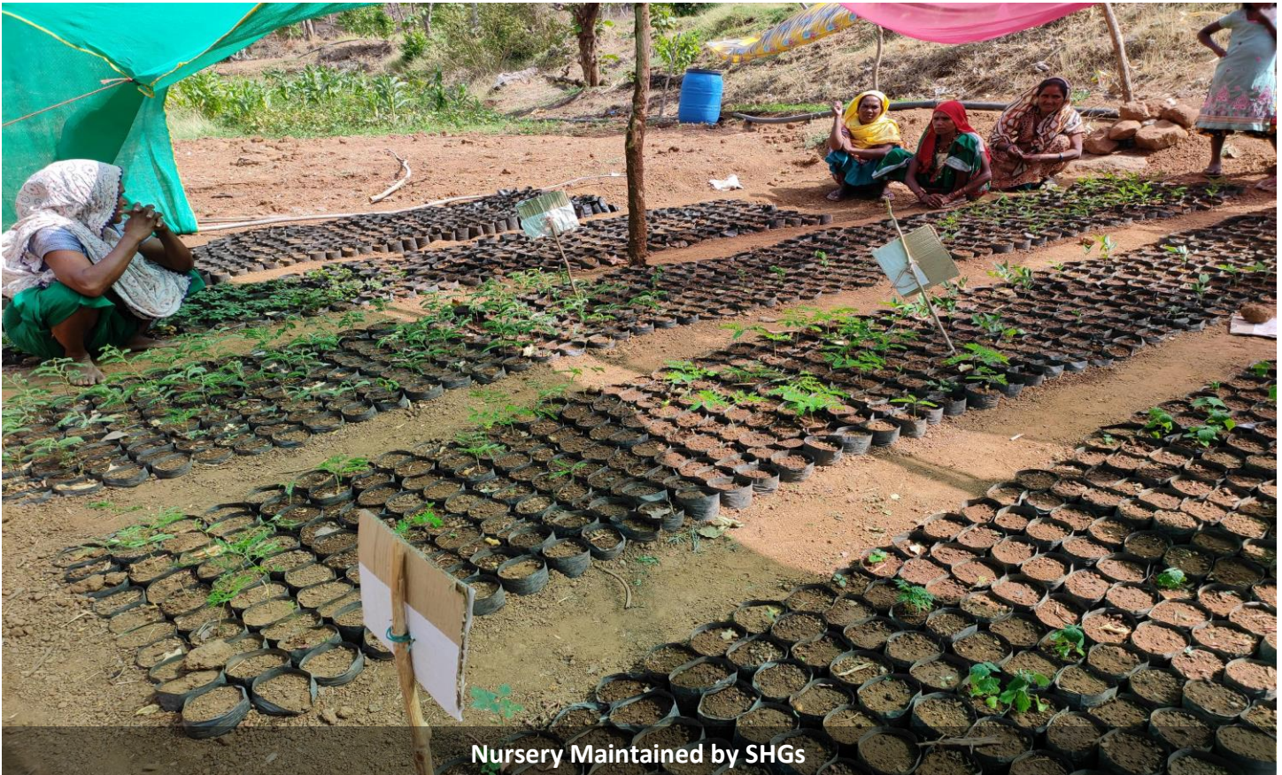
Nursery Maintained by SHGs