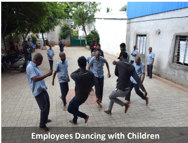
Employees Dancing with Children

June, 2022 – Sarva Mangal Family Trust team organized Corporate Social Responsibility Employee Engagement Activity for all MSI Bangalore employees. The aim behind this activity was to motivate employees to devote some of their time in social work activity.