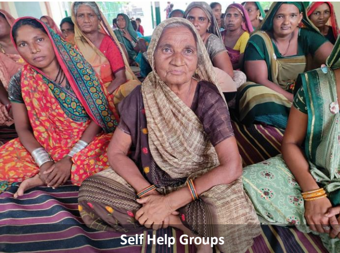
Self Help Groups