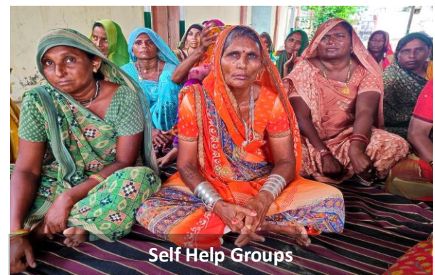
Self Help Groups