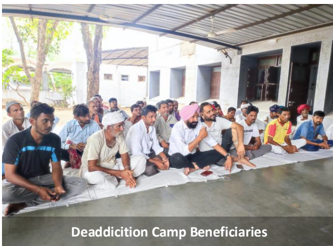
Deaddiction Camp Beneficiaries