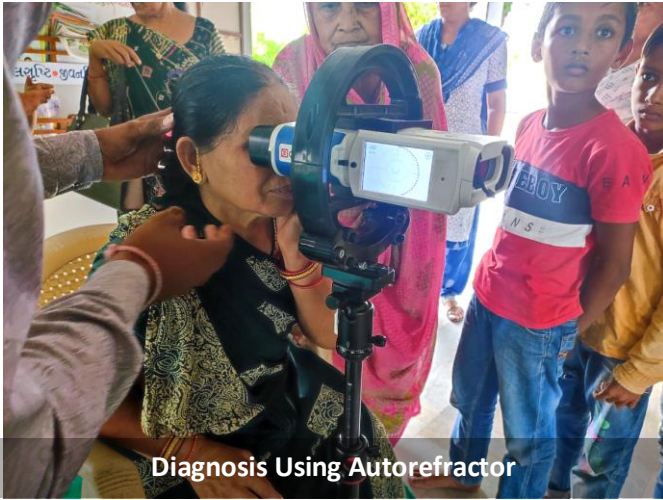
Diagnosis Using Autorefractor