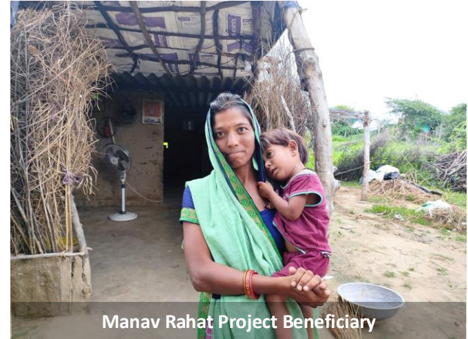
Manav Rahat Project Beneficiary