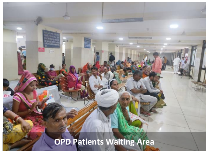
OPD Patients Waiting Area