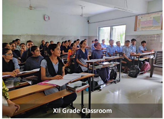
XII Grade Classroom