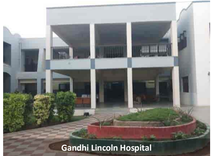
Gandhi Lincoln Hospital