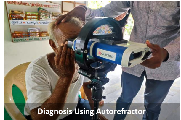
Diagnosis Using Autorefractor

Since 1982, Bhansali Trust runs a multidisciplinary 220-bed Gandhi Lincoln hospital in Deesa. The hospital has specialized departments including pediatrics, gynecology, orthopedics, pathology, radiology, ENT, psychiatry, and ophthalmology, in addition to its comprehensive medical and surgical units. Ensuring prompt and accurate diagnostics, the hospital has a fully equipped laboratory and an independent blood bank, reinforcing its commitment to delivering essential healthcare services to the community.