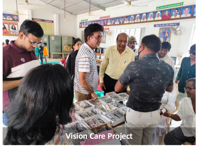
Vision Care Project