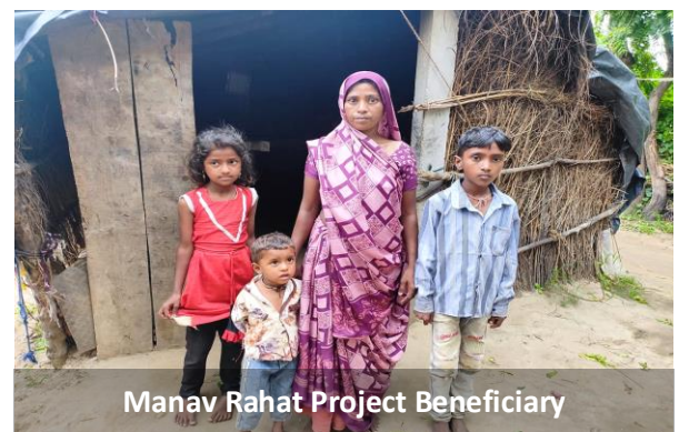
Manav Rahat Project Beneficiary