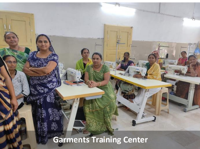
Garments Training Center