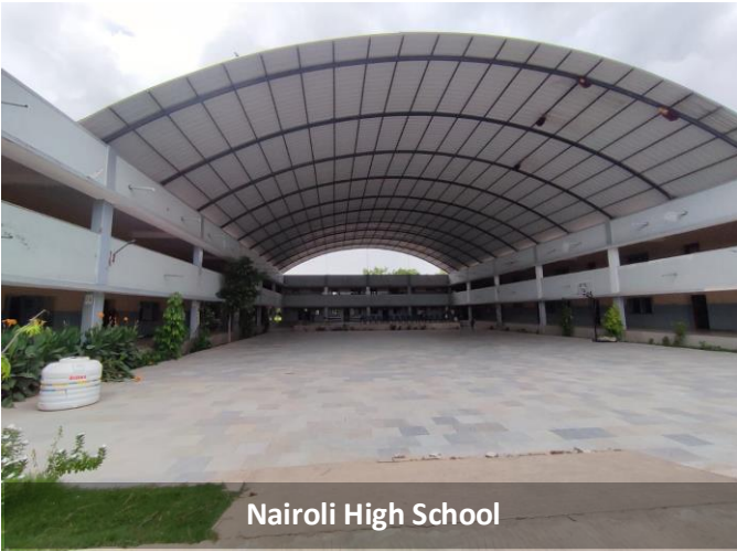
Nairoli High School