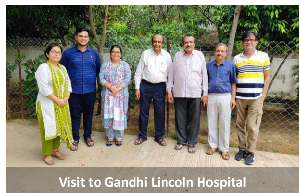
Visit to Gandhi Lincoln Hospital