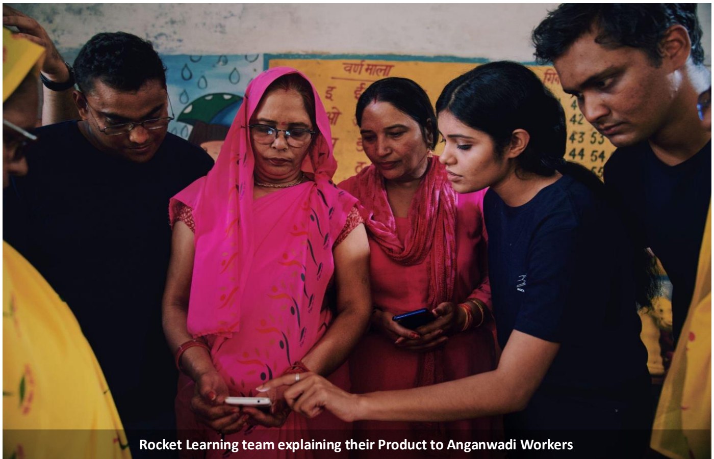
Rocket Learning team explaining their Product to Anganwadi Workers