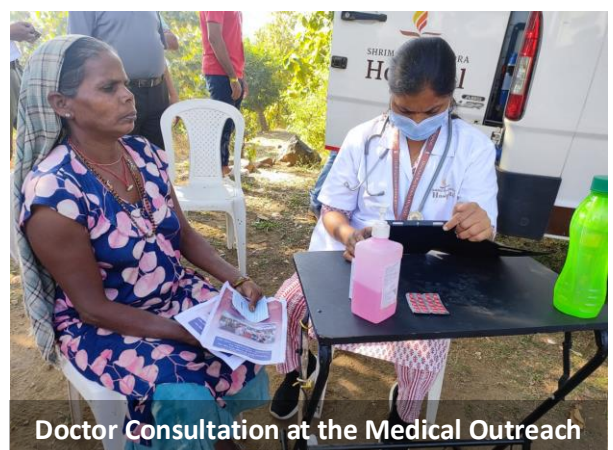
Doctor Consultation at the Medical Outreach