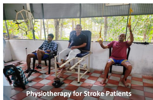
Physiotherapy for Stroke Patients