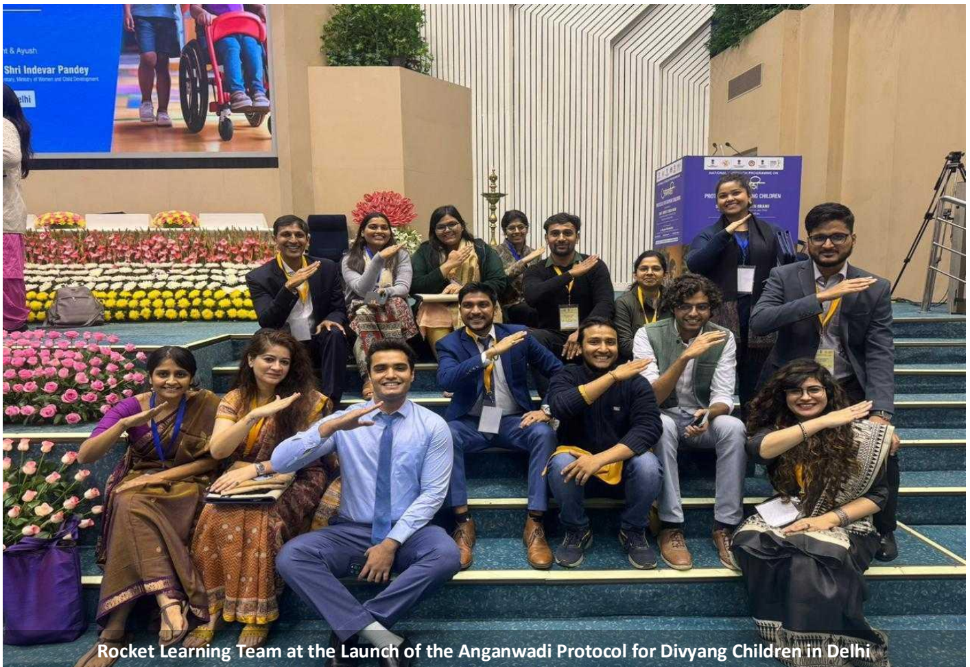
Rocket Learning Team at the Launch of the Anganwadi Protocol for Divyang Children in Delhi