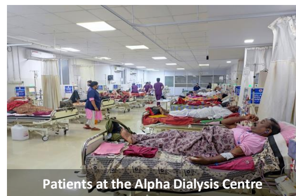
Patients at the Alpha Dialysis Centre