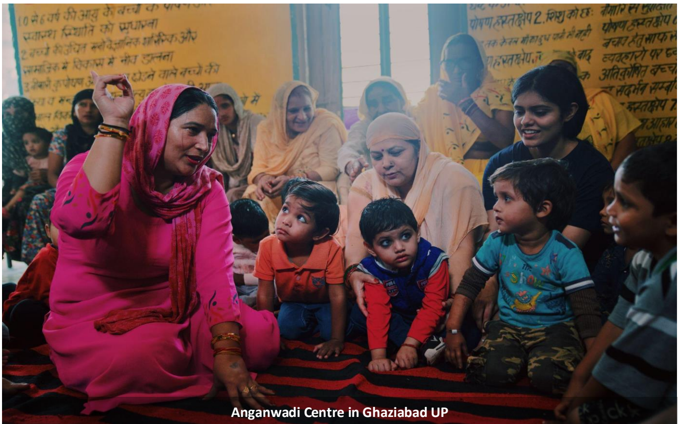
Anganwadi Centre in Ghaziabad UP

The initiative focuses on enabling behaviour change in primary caregivers through AIM - Awareness (emphasizing the need for Early Childhood Care and Education), Information (delivering educational content through Government-anchored WhatsApp groups), and Motivation (providing personalized nudges for at-home activity completion and in-classroom instructions). This approach aims to establish teaching and engagement as habits, strengthen the teacher-parent relationship, and foster a community movement towards Early Childhood Care and Education (ECCE). The ultimate goal is to unlock transformative early learning experiences, building readiness and motivation for future learning among children.