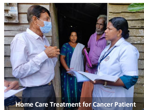
Home Care Treatment for Cancer Patient