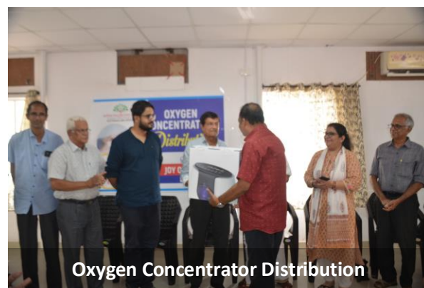
Oxygen Concentrator Distribution

SMFT's donation of 100 oxygen concentrators is a testament to their shared commitment to compassionate care. It is a step towards strengthening the resources necessary for Alpha Palliative Care Centre to continue its mission of providing unwavering support and care to those in need.