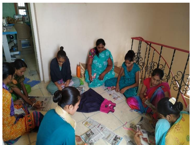
Fashion Designing Class