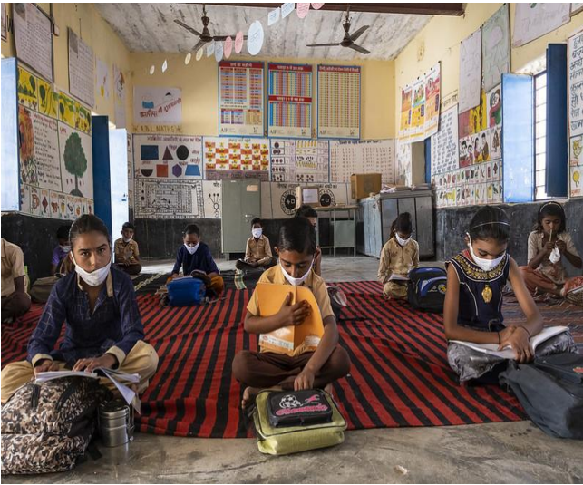
Learning and Migration Program