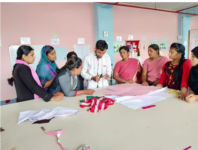
Fashion Designing Class