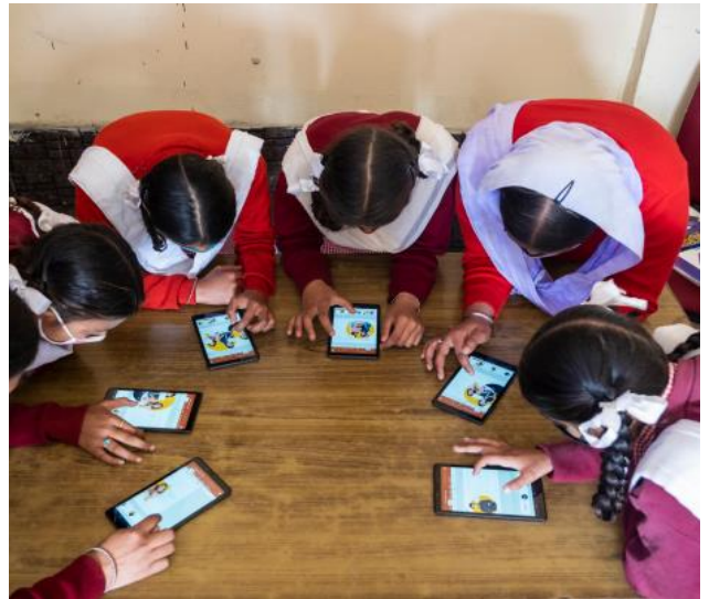
Students using Tablet