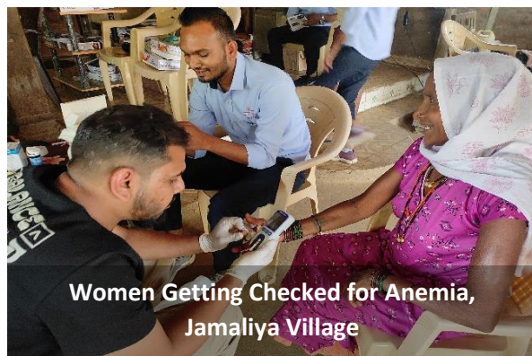
Women Getting Checked for Anemia, Jamaliya Village