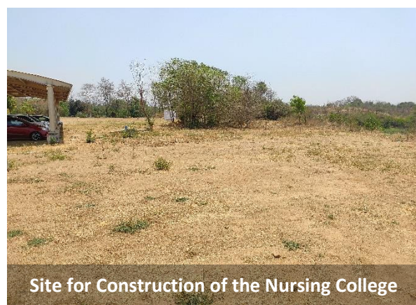
Site for Construction of the Nursing College