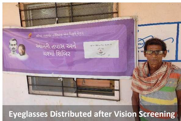
Eyeglasses Distributed after Vision Screening