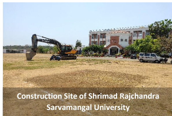
Construction Site of Shrimad Rajchandra Sarvamangal University

At the centre, the team met the Project Manager of the Shrimad Rajchandra Education Outreach Programme (SREOP), which impacts over 43,000 students annually. Programs include the Udyam project, Divinetouch sessions, and a community development initiative supporting 12 villages in accessing government schemes, healthcare, and livelihoods. Through these initiatives, SRLC and SMFT aim to uplift rural students and expand access to quality education.