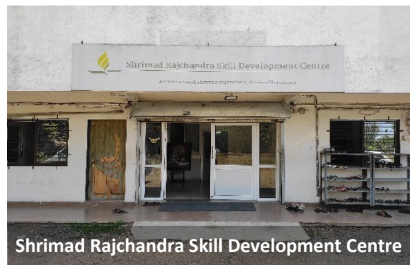
Shrimad Rajchandra Skill Development Centre