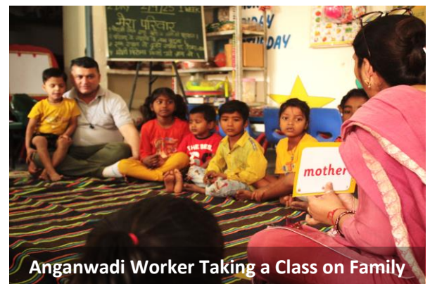
Anganwadi Worker Taking a Class on Family