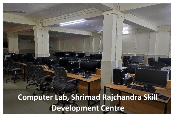
Computer Lab, Shrimad Rajchandra Skill Development Centre