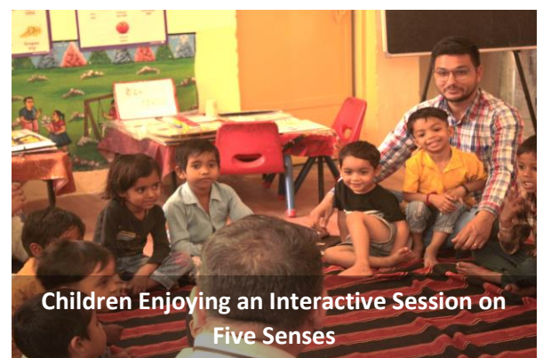
Children Enjoying an Interactive Session on Five Senses