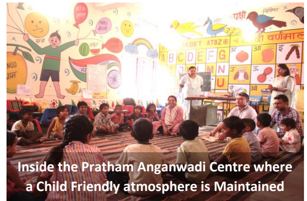
Inside the Pratham Anganwadi Centre where a Child Friendly atmosphere is Maintained

Though Pratham's work primarily centers on empowering Anganwadi Workers, they also advocate with relevant Government authorities for increased investment—making the project both economical and highly scalable.