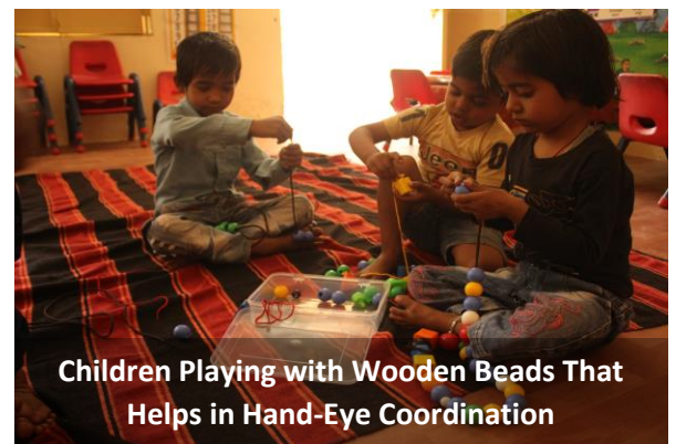
Children Playing with Wooden Beads That Helps in Hand-Eye Coordination