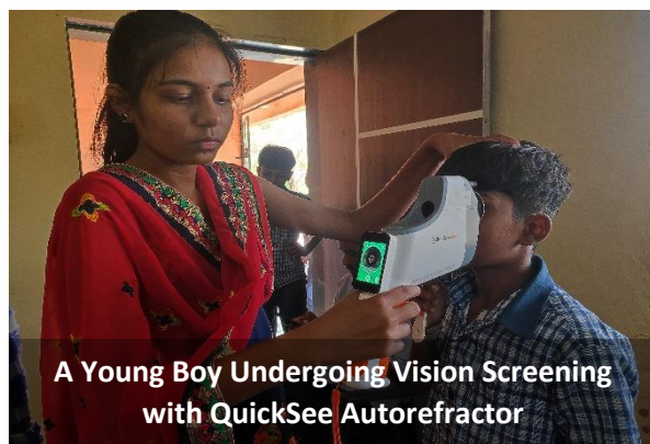
A Young Boy Undergoing Vision Screening with QuickSee Autorefractor