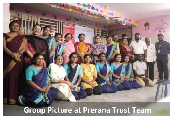
Group Picture at Prerana Trust Team