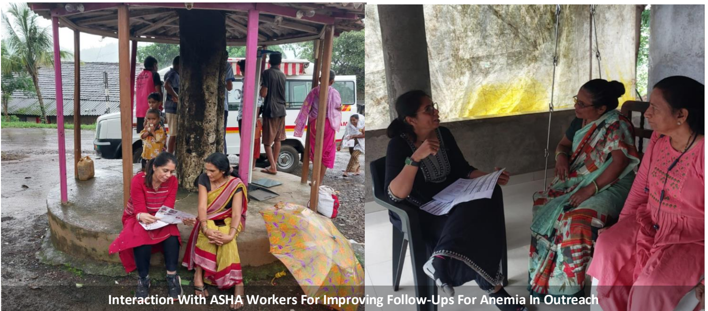
Interaction With ASHA Workers For Improving Follow-Ups For Anemia In Outreach