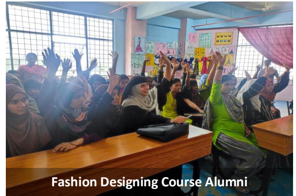
Fashion Designing Course Alumni

As the Sarva Mangal Family Trust Team walked through the doors of the Market Aligned Skills Training Center, they witnessed not just a physical space, but a realm of potential, resilience, and transformation. It's a place where dreams are nurtured, skills are honed, and futures are rewritten. This center stands as a testament to the power of education and training in fostering inclusive growth and propelling India towards a brighter, more equitable future.