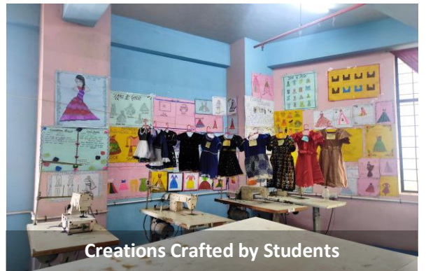
Creations Crafted by Students