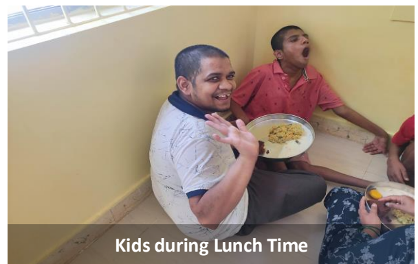
Kids during Lunch Time