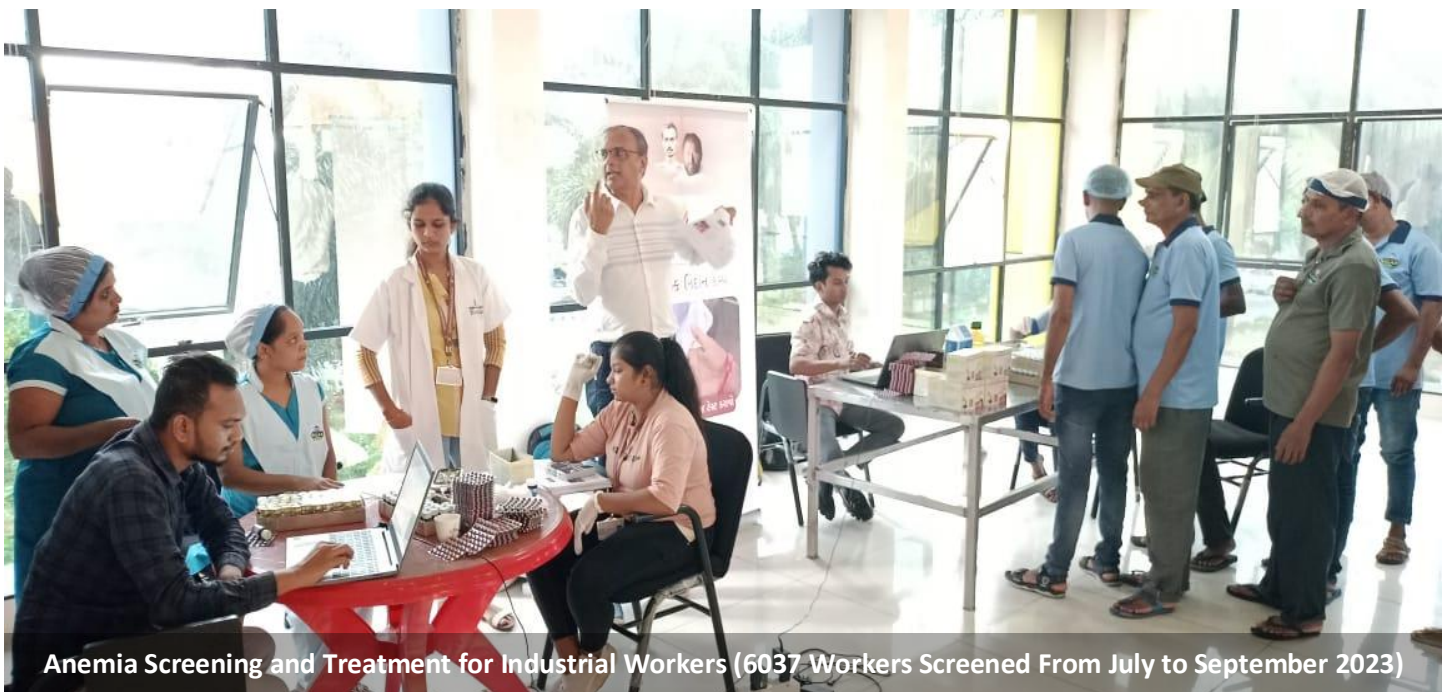
Anemia Screening and Treatment for Industrial Workers (6037 Workers Screened From July to September 2023)