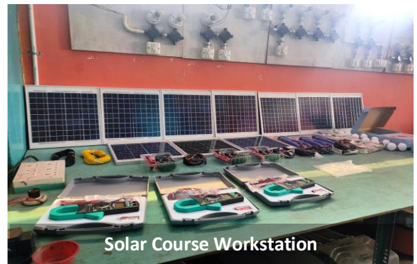
Solar Course Workstation