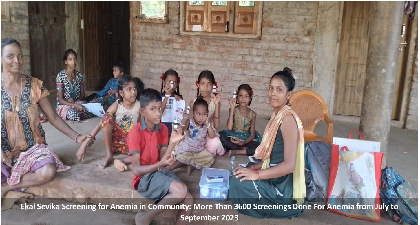
Ekal Sevika Screening for Anemia in Community: More Than 3600 Screenings Done For Anemia from July to September 2023