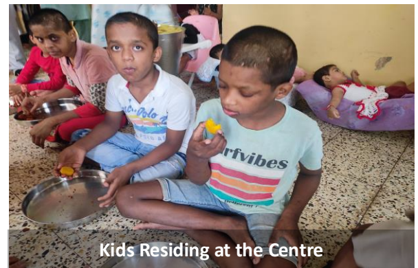
Kids Residing at the Centre