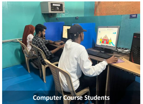
Computer Course Students