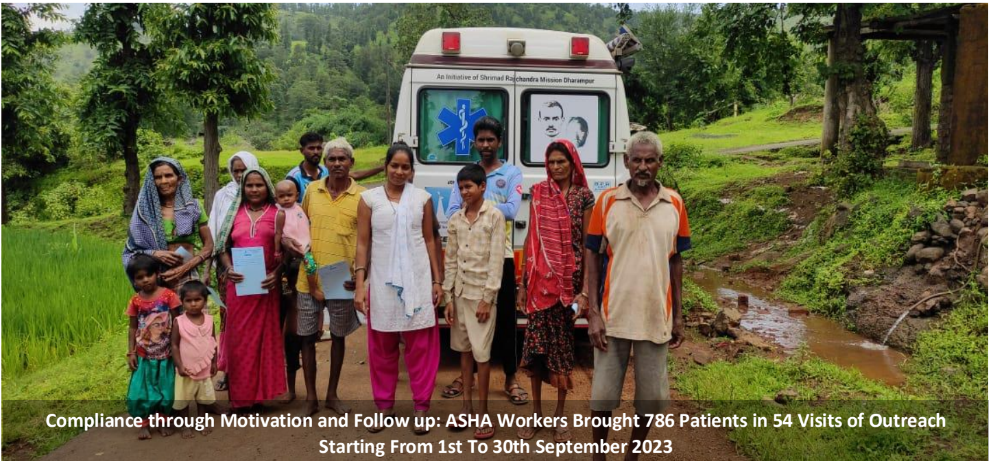
Compliance through Motivation and Follow up: ASHA Workers Brought 786 Patients in 54 Visits of Outreach Starting From 1st To 30th September 2023

ASHA workers have started motivating and bringing patients for screening and follow up for Anemia in the Outreach Vans